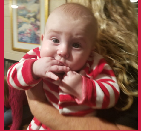
One of our Blessing Tree angels enjoying a snacks before opening gifts